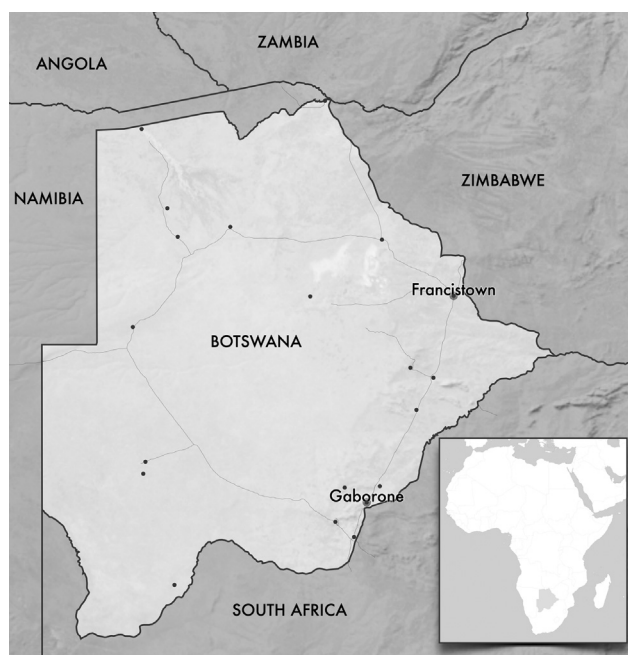
Fig. 1. Map indicating Gaborone and Francistown, Botswana. The majority of cancer care is delivered in referral centers in these cities.

Private Hospital and Bokamoso Private Hospital in Gaborone, but this care is limited by human capital and unreliable access to medications and diagnostics. Expatriate oncologists, recruited to Botswana through a service program of the government of China or through a for-profit Indian medical staffing company, supervise care at the public oncology facilities, along with generalists (medical house officers). Since 2007, medical oncologists from the Texas Children's Hospital have provided specialized care for children with cancer. A few clinical oncologists, trained in both radiation and medical oncology at foreign institutions, practice in the private sector. At the government facilities and sometimes even private facilities, there are shortages of chemotherapeutic agents and other antineoplastic drugs, leading to interruptions in, or missing components of, multidrug regimens, and to shortages of drugs to manage the complications of therapy, including antiemetics, antibiotics, narcotics, and growth factors. There are also challenges with regard to cancer diagnosis, inasmuch as both the tools and the personnel to perform biopsies are in short supply, often delaying the start of treatment.