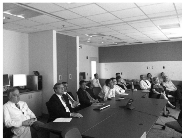
Fig. 5. Botswana-Harvard multidisciplinary tumor board. Above, Gaborone. Below, Boston.

nurses, therapists, and students) with MGH/Harvard-based disease site experts (Fig. 5). Since its initiation during the first visit of the BOTSOGO team to Botswana in February 2012, the tumor board has met monthly to discuss specific patient management challenges. Attendees in Botswana and the United States have been able to conduct these meetings through an internet-based platform (WebEx, Santa Clara, CA). Thus, we have fostered relationships not only between care providers in Botswana and MGH/Harvard but also among care providers from different disciplines and different institutions within Botswana. In addition to providing a venue for education and constructive peer review, the conference provides a regular forum for discussion of relevant health systems issues.