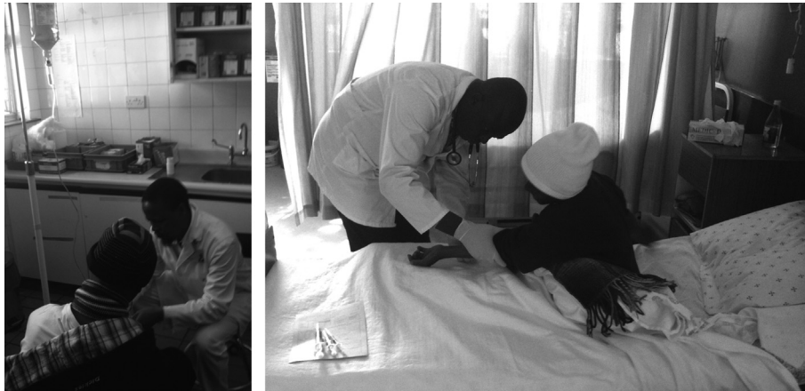
Fig. 3. Chemotherapy administration at Princess Marina Hospital.

Notably, however, other sub-Saharan countries with significantly larger populations (eg, Rwanda and Mozambique) have no such facility. A teaching hospital affiliated with the University of Botswana is under construction and plans to include radiation therapy services in the future.