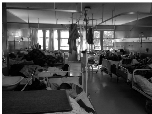
Fig. 2. Princess Marina Hospital, Gaborone, (above) and Nyangabgwe Referral Hospital, Francistown (below). Long waits and crowded facilities are common in these referral hospitals.

capital but also by a lack of the necessary equipment to care for a population this large. 1 For the vast majority of specimens, histologic appearance alone is used for diagnosis and grading of malignancies.