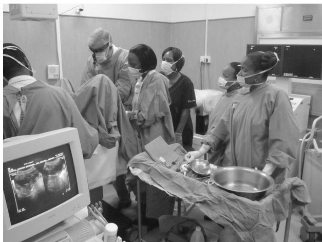
Fig. 4. Ultrasound-guided cervical brachytherapy insertion, Gaborone Private Hospital.

Inc., Mount Vernon, NY). These applicators provide ideal geometry for the advanced disease typically seen in Botswana. Further visits by our team in May and September 2013 and additional support from the Botswana—University of Pennsylvania collaboration have helped optimize the procedure. The oncologists at GPH have now developed significant expertise, and they treat 30 to 50 brachytherapy cases per month.