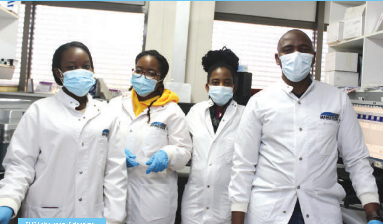
BHP Laboratory Scientists

Pursuant to the Memoranda of Agreement for SARS-CoV-2/COVID-19 testing between the Ministry of Health and Wellness (MOHW) and the Botswana Harvard AIDS Institute Partnership (BHP), as at 16th August 2021, of the 1,599,459 SARS-CoV-2 tests undertaken in Botswana, the BHP had done 514 000 polymerase chain reaction (PCR) tests.