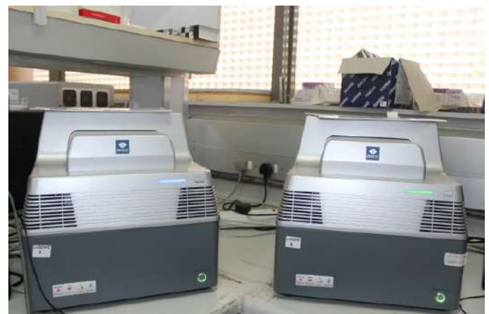
LineGene Amplification & Detection Machines

Maphorisa also noted occasional shortages of basic items such as reagents and consumables, which were subsequently resolved with large purchases from Manufacturers by the MOHW and Presidential Task Force. Another challenge is the availability of transport for staff working on night shifts.