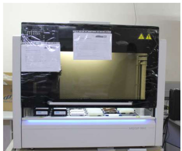
MGISP Extraction Machine